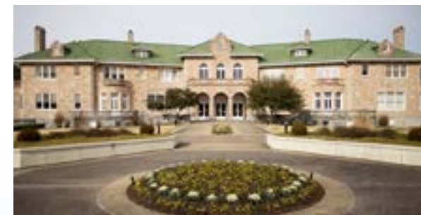
Pink Palace Museum

Take time to explore the Pink Palace Museum , a unique location dedicated to the exploration and culture of the Mid-South through dioramas, audiovisuals and riveting exhibitions. Learn from the award-winning medical exhibit how health care became the largest industry in Memphis. History enthusiasts of all types will find intriguing exhibits, from dinosaur exploration to the six yellow fever epidemics Memphis residents experienced in the 19th century.